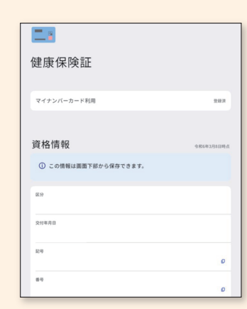
4 From "Eligibility information" you can confirm your registered health insurance card information.