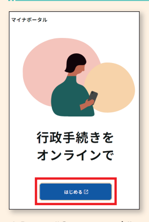
1 Press "Get started."