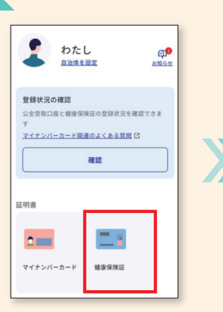
3 After logging in, press "Health insurance card."