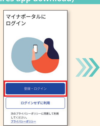
2 Press "Register/login" and log in to the Individual Number Portal.